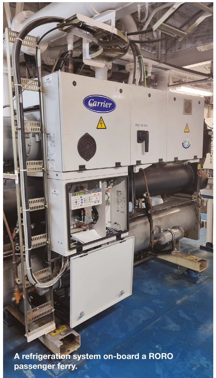
A refrigeration system on-board a RORO passenger ferry.