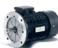
Hoyer ATEX zone 22 Motors