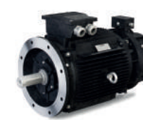
Hoyer Marine Brake Motors