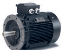
Hoyer Marine Motors