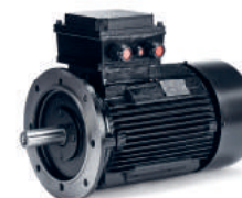
Hoyer EEx Motors