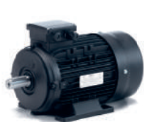
Hoyer Industrial Motors