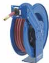
8.723-649.0 (hose and ball stop not included)

Coxreels offer high performance in a very compact and lightweight hand crank or spring driven hose reel. Perfect for mobile application and permanent floor and wall mount.