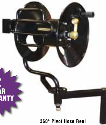
360° Pivot Hose Reel