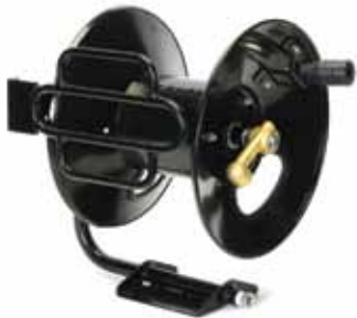
Fixed Base Hose Reel