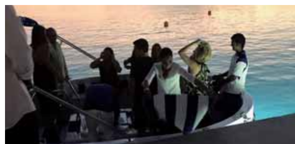
Romantic on-board night parties