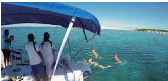
Swimming in the middle of an ocean