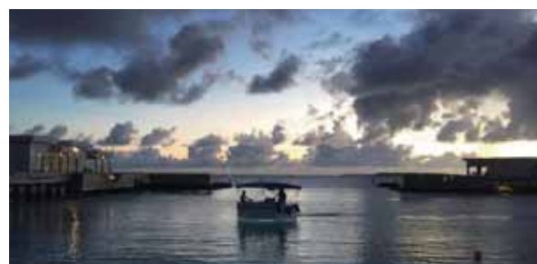
Once-a-day sunset cruise (run at dusk)