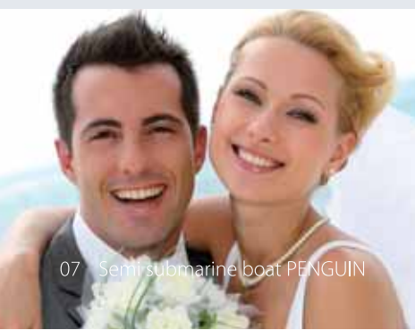
07 Semi-submarine boat PENGUIN

Semi submarine boat PENGUIN is currently operated by 5 star resorts in the Maldives and in establishing as a new category of the Maldives' marine leports.