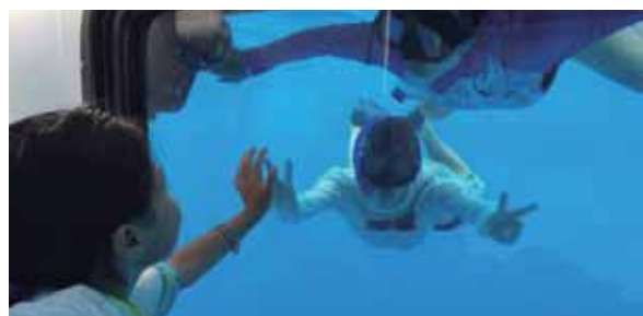
Safe and easy snorkeling