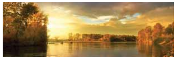
Undiscovered rivers and lakes