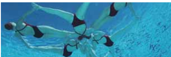
Organizing underwater performances