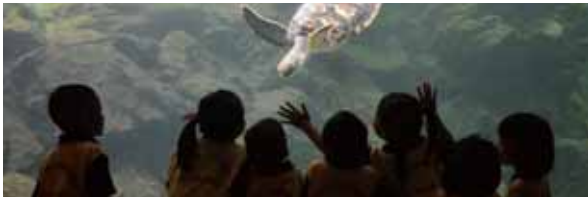
Learning the marine ecosystem

Penguin Ocean Leisure is developing a wide range of underwater contents.