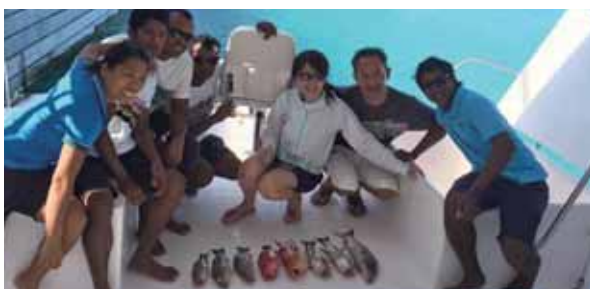
Sea fishing while observing the inside of the sea