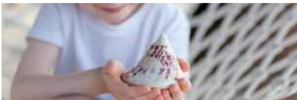
Experiencing marine creatures