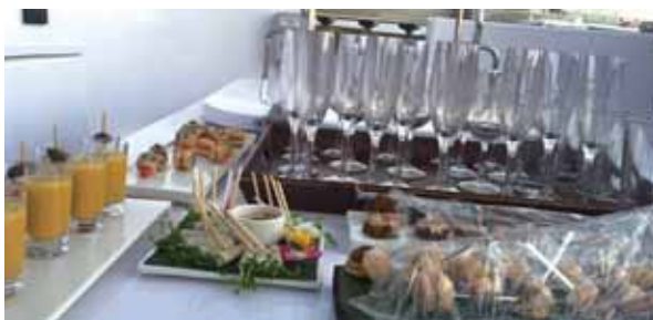
Picnic on the sea