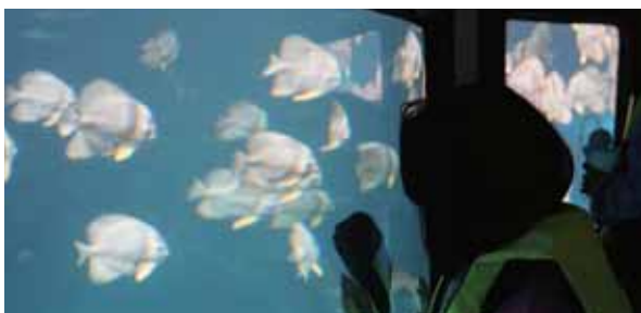
Underwater excursion with children