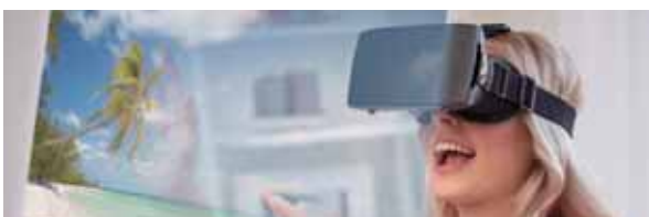
Collaborating underwater contents with Information Technology