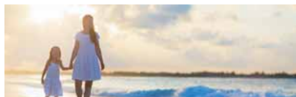
Places with stories