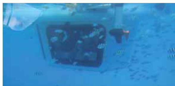
Fish-feeding, which kids like very much