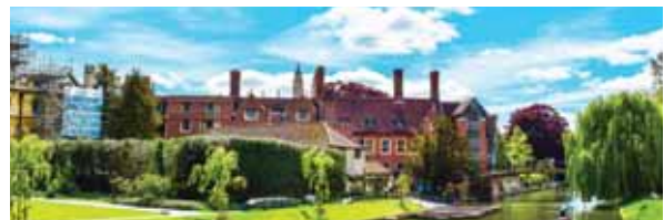
Amusement parks / Ocean theme parks