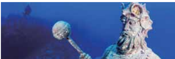
Watching underwater sculptures