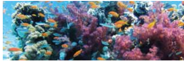
Coral reefs / Atoll areas

Penguin Ocean Leisure is looking for new places around the world where semi submarine PENGUIN can be operated.