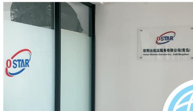
Ostar QINGDAO Headquarter