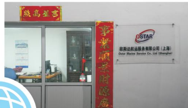
Ostar SHANGHAI Office