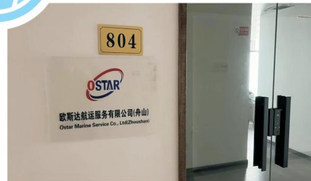
Ostar ZHOUSHAN Office