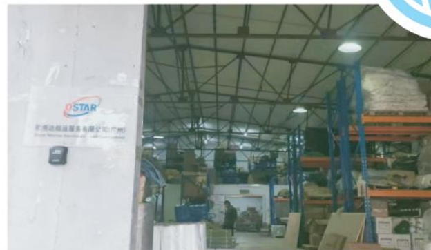
Ostar GUANGZHOU Office