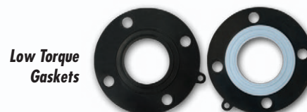
Low Torque Gaskets