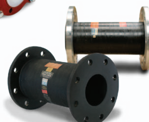
Rubber Pipe Connectors