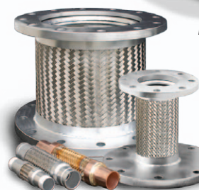
Flexible Metal Hose