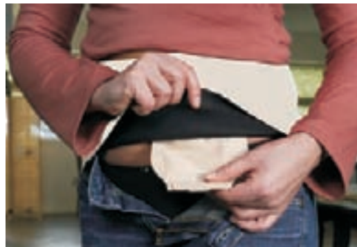
The pocket reduces pressure on the hernia and pouch.

Stabilising effect during exercising, bathing and sexual activities. Reduces noise. The belt supports and stabilises, while the pocket reduces pressure on stoma and pouch.