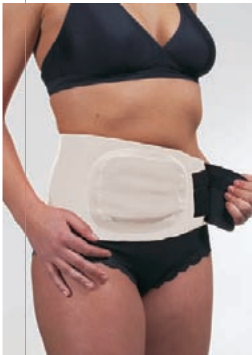
Adaptable to individual body shape.