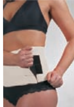
Easily adjustable Velcro fastening.