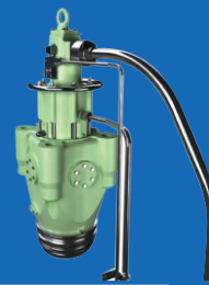
EXHAUST VALVE CAGE