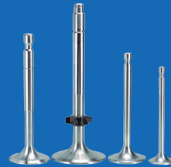
EXHAUST VALVE - SPINDLE & SEAT