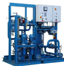
Auramarine MGO Unit