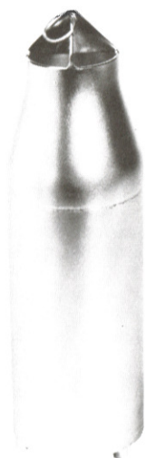
Model No. 1LTR-2.5X10LG