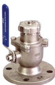
MODEL. C-50 (2" BORE)

TANK GAUGING STATION [VAPOR LOCKS] (ULLAGE GAUGING & SAMPLING)