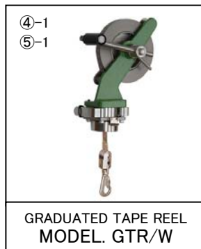
GRADUATED TAPE REEL MODEL. GTR/W