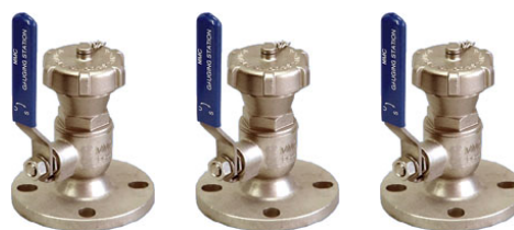
MODEL. D-25 (1" BORE)

TANK BOTTOM DRYNESS CHECKING STATION [VAPOR LOCKS]