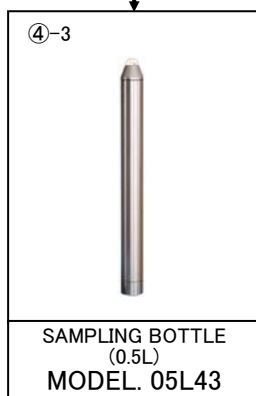
SAMPLING BOTTLE (0.5L) MODEL. 05L43