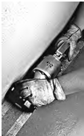
ABOVE, Model K-7-1, K7-2; TOP RIGHT, Model MP6; RIGHT, Model KP5