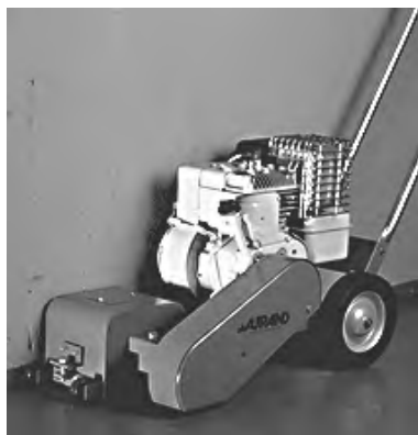
ABOVE, Model AUR-GW1