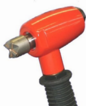
SF1 heavy duty scaler - single head