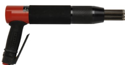
VL303 or VL203 needle scaler