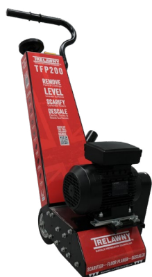
TFP200T 200mm deck scaler Use with KV30 vacuum