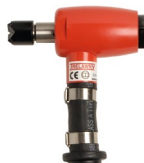
SF1 heavy duty scaler - single head