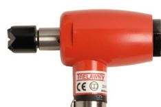
SF1 heavy duty scaler - single head