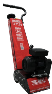
TVS TFP200T 200mm deck scaler Use with KV30 vacuum