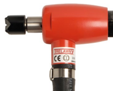
SF1 heavy duty scaler - single head