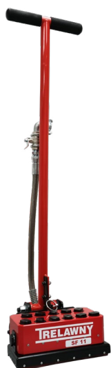
SF11 pneumatic deck hammer