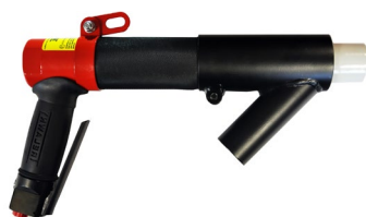
VL303 or VL203 ATEX needle scaler