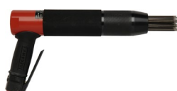
VL303 or VL203 needle scaler