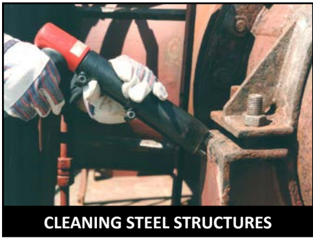
CLEANING STEEL STRUCTURES