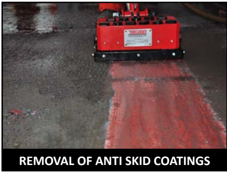
REMOVAL OF ANTI SKID COATINGS