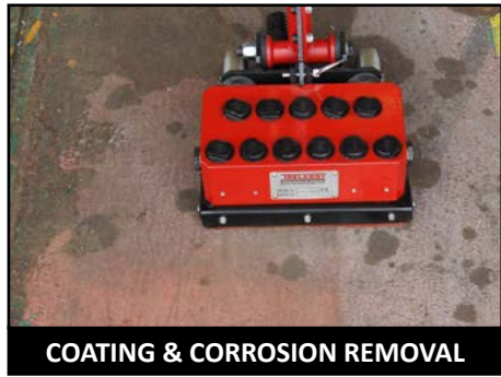
COATING & CORROSION REMOVAL