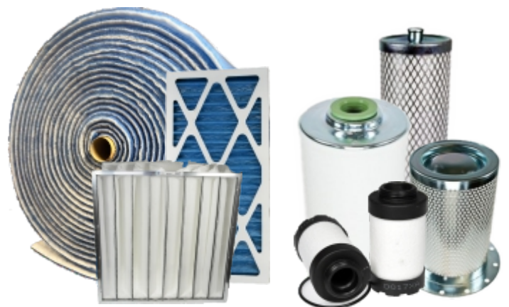
HVAC filters and filter rolls. Pneumatic filters and absorption dryers.