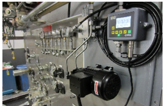
Particle counter. Oil quality monitoring according to ISO standards.