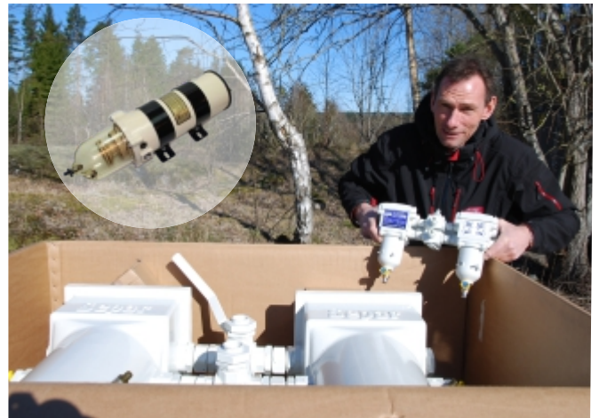
Diesel fuel water separators.