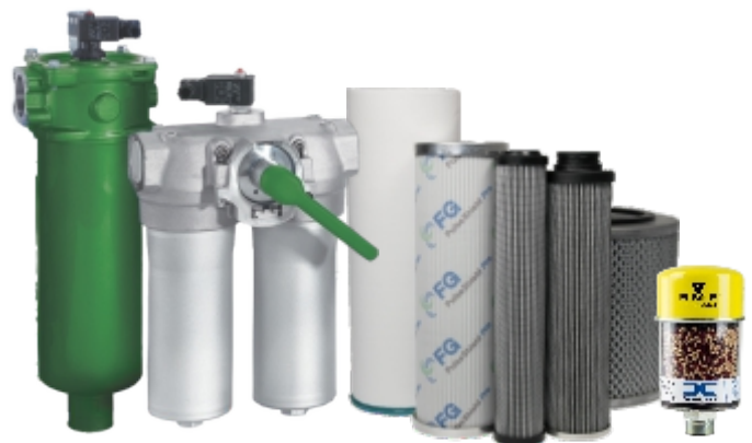
Filter housings and filter packages for hydraulic and lube oil.