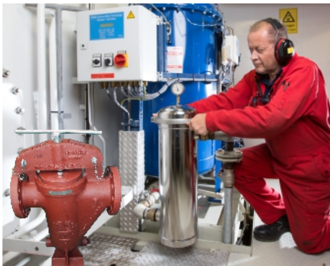
Water and process filter housings and strainers.