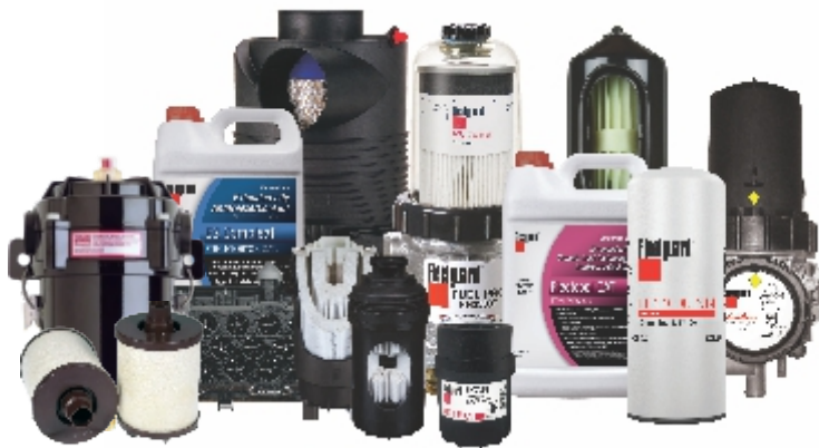
Filter packages for diesel engines and diesel generators.