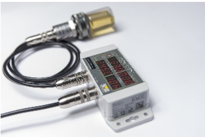
Oil quality sensor and display.

-The easy way to monitor oil quality in critical hydraulic systems