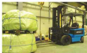
FORK LIFT (2.5tons)