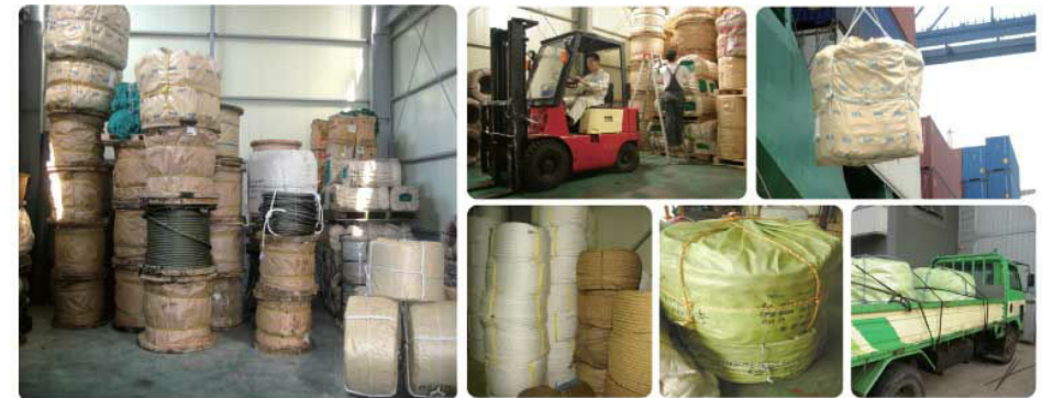
ATLAS, KARAT, P.P, HAWSER ROPES, CRANE WIRE ROPES