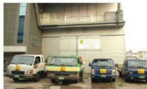
TRUCKS (2.5/ 1.5tons)