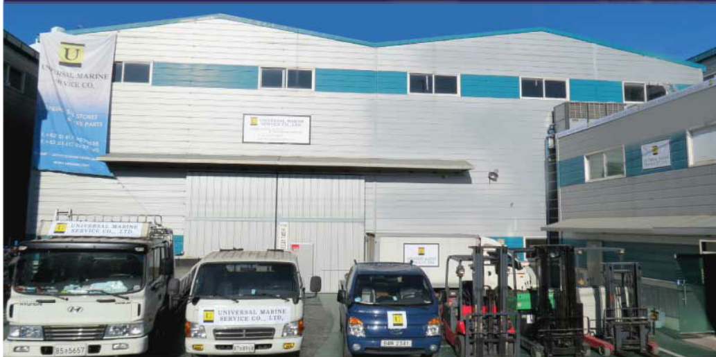
COMPANY OF UNIVERSAL MARINE