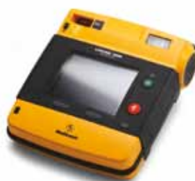
LIFEPAK® 1000 Defibrillator