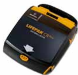
LIFEPAK CR® Plus Automated External Defibrillator