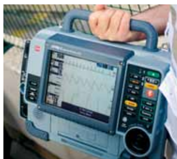
Dual-mode LCD screen with SunVue display