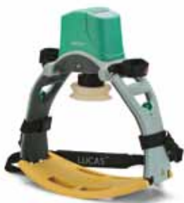
LUCAS™ Chest Compression System