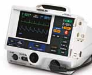
LIFEPAK® 20e Defibrillator/Monitor