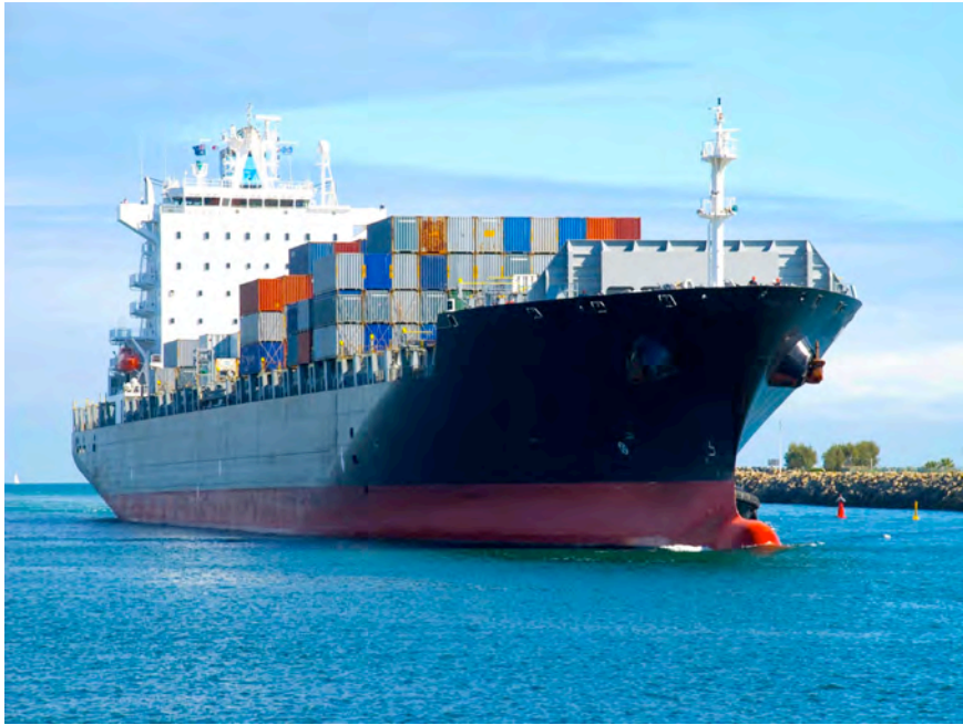
The Commercial Maritime Industry

Universal is one of the largest suppliers to: