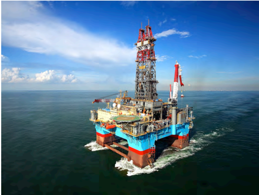
The Offshore Oil Rig and Servicing Industry

Universal is one of the largest suppliers to: