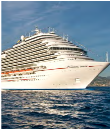
Leading Supplier to Maritime Industry

Building on More than 35 Years of Service and Partnership