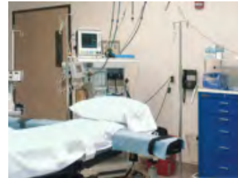
Turnkey Medical/Pharmacy Supply w/Competitive Pricing and Inventory Management