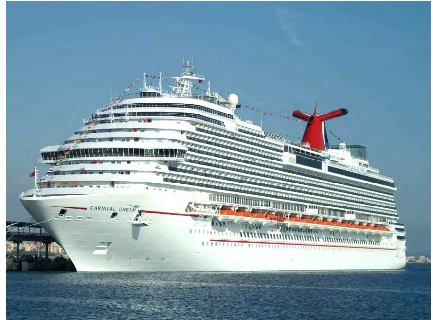
The Cruise Line Industry