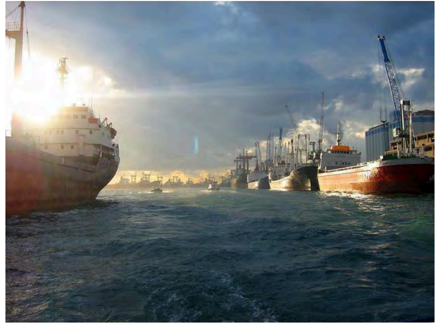
The Chandler/Ship Management Industry