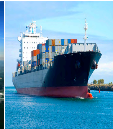
Supplier to Oilrigs and Freighters