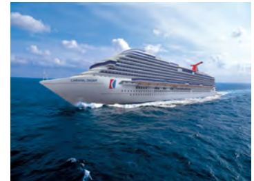
Superior Logistics and One-to-One Customer Service