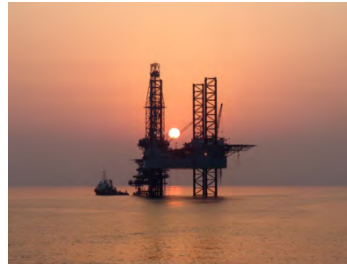
Global Footprint and Distribution Capabilities