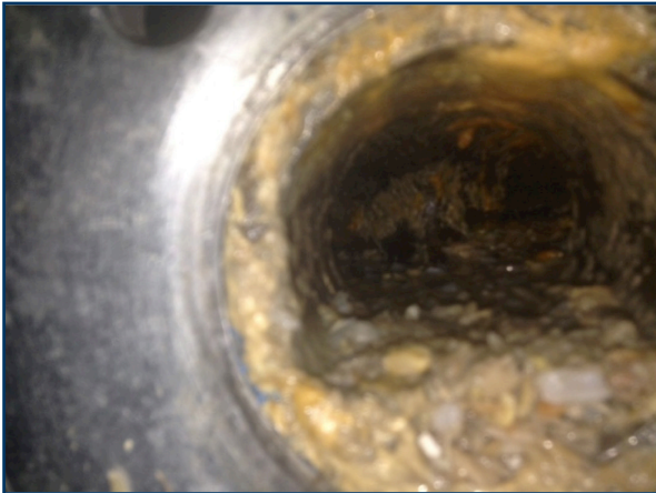
Clogged drain pipe

The main reason for this is that the velocity of the ground food waste in the piping system is too low.