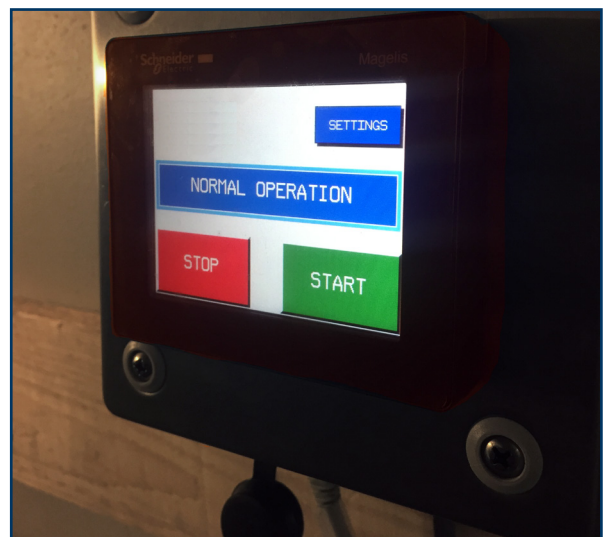
GDU-50 Operating panel