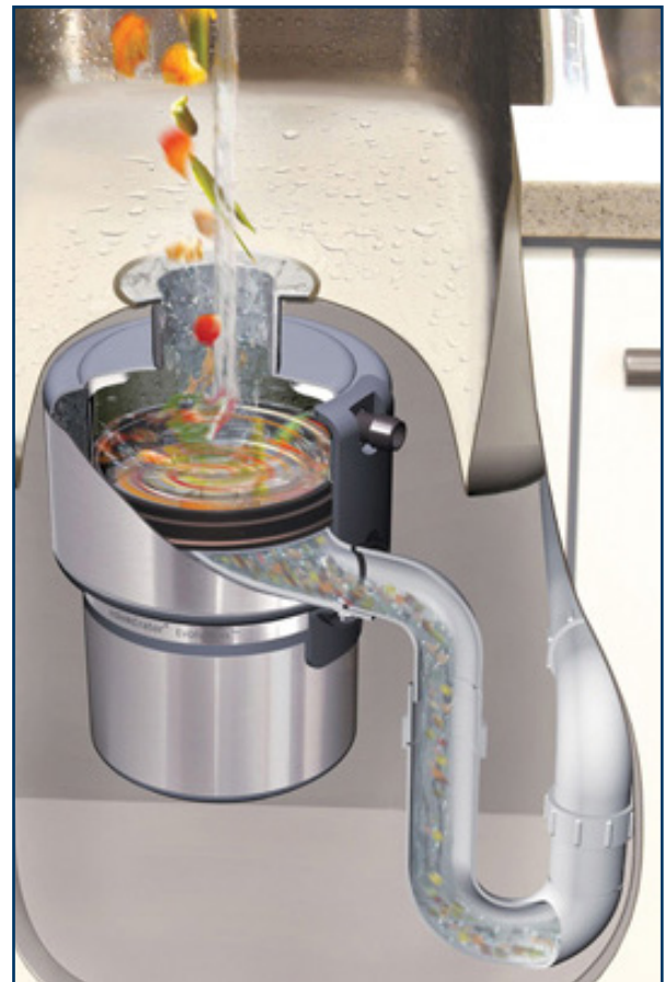
Food waste disposer.

A disposer with a rating of 4 kW or higher can easily handle larger items, such as normal-sized bones. The smaller units (< 1 kW) are normally installed in households and tend to get jammed easily.