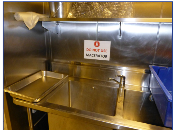
Normal situation on board a vessel - "Do not use macerator"...

Ask your crew for their experience before installing a simple disposer!