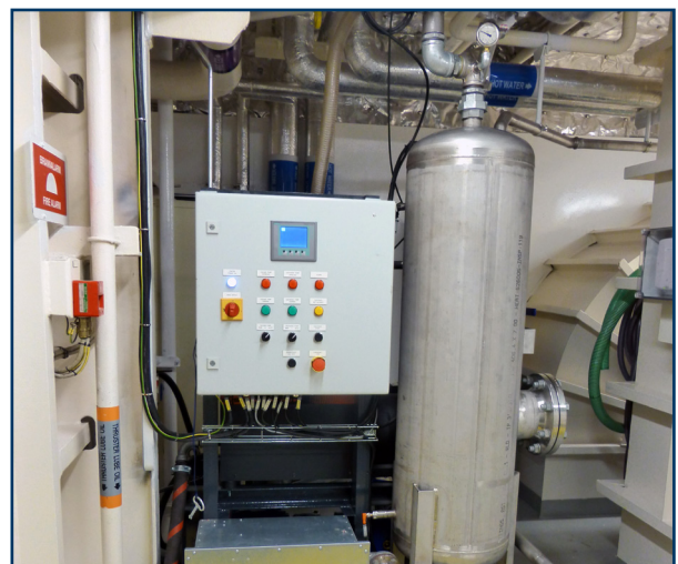
On board installation of Vacuum unit VU-65.