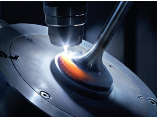
■ Powder Welding.

As an OEM engine builder with the goal of helping customers succeed, Caterpillar Motoren manufactures its own MaK exhaust valves to the highest quality standards, giving you the assurance of long component life. For more than 25 years, MaK exhaust valves have been manufactured at the Caterpillar-owned factory in Kiel, Germany, by highly qualified personnel utilizing the same quality manufacturing processes used for our engines.