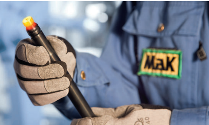
■ Inductive Hardening.

Design and manufacturing techniques are continually improved to ensure that using original MaK parts enhances engine performance, reliability, and reduces overall owning and operating costs – benefits you may not get from ‘grey market’ competitive parts. And, as you would expect, all Genuine MaK parts are backed by the Caterpillar Motoren parts warranty.