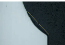
The nitriding layer (a heat treat hardening process) in the valve clamping area is not complete.