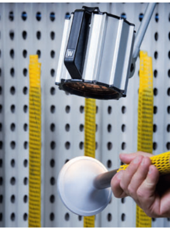
■ Last Inspection.

Genuine MaK valves are the only valves engineered and manufactured to the specific standards and tolerances required to work optimally with MaK engines. Our exhaust valves are faced with one of the most sophisticated heat and corrosion resistant material available today. Powder welding to the valve, using a proprietary process designed by MaK engineers, ensures complete fusion and bonding to the parent material.