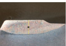
Transverse microsections through the hard facing depth up to 1.0 mm below the original dimension of the valve, meaning that a first regrinding step would not be possible because there is no more undercut.