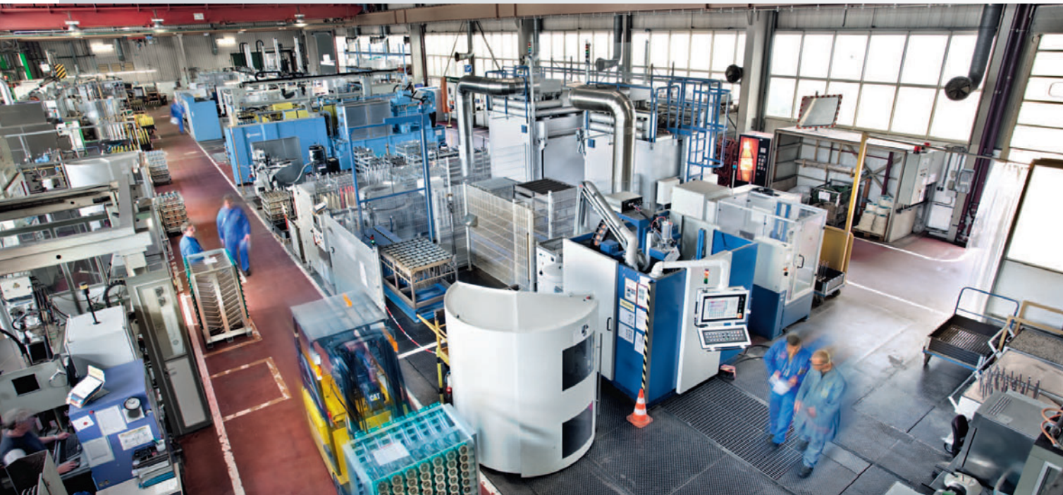
■ Valve Production, Kiel/Germany.