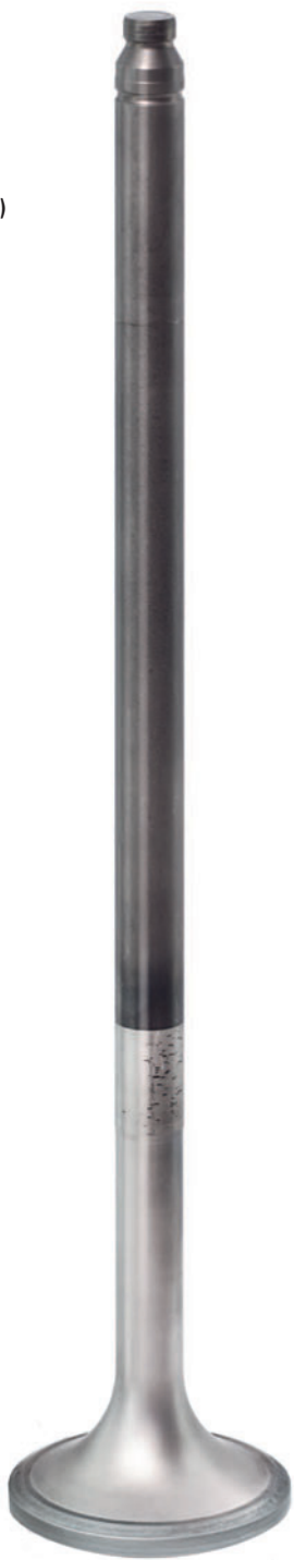
■ Grey Market Exhaust Valve.