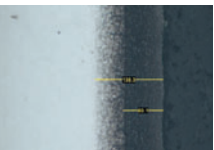
The depth of hardening on the stem face does not conform to specification, and the hardness of the grey market part is 25% lower, which will lead to increased wear.