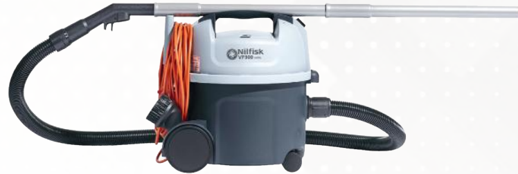
VP300 can be carried safely and comfortably in one hand