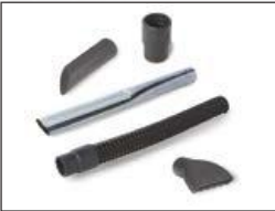
Accessories for different applications