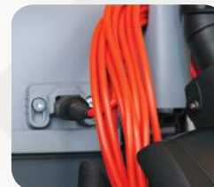
Detachable orange cord on selected variants