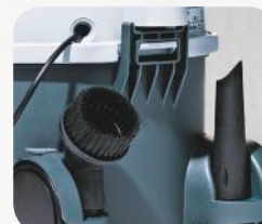
Discreet storage for nozzles allow all the tools you need to be within easy reach at all times