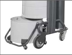
Container release system