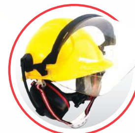
Safety Helmet with Ear Muff and Face Shield