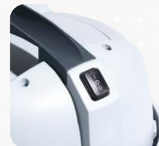
Dual speed for tailored use in a wider variety of applications