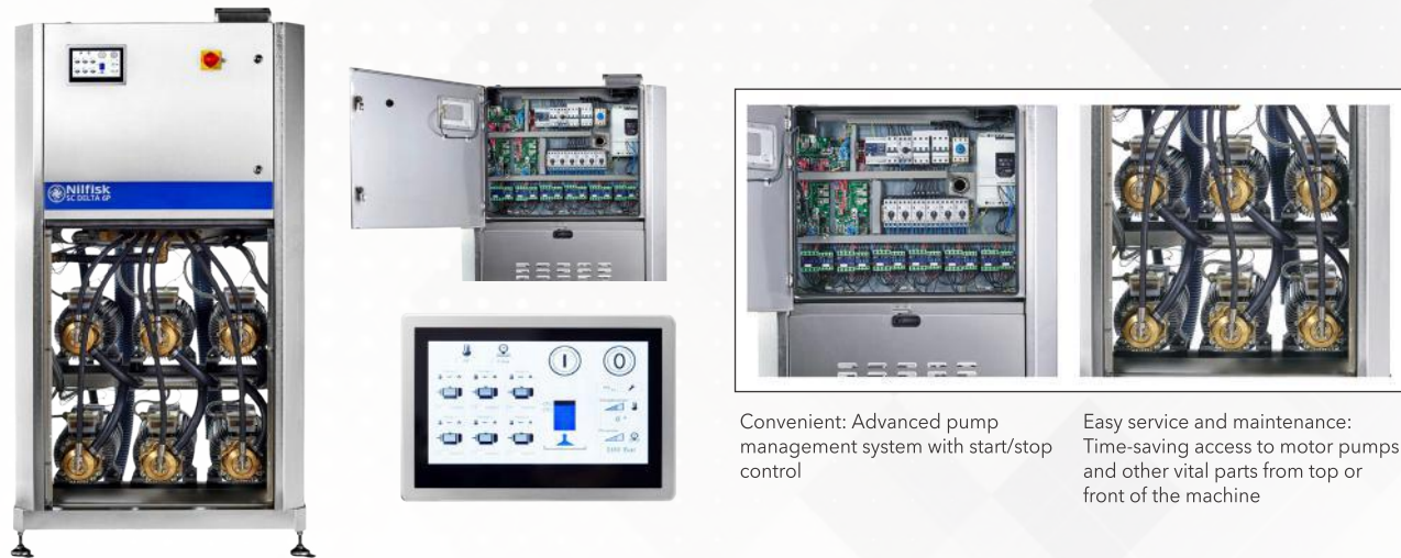
Convenient: Advanced pump management system with start/stop control Easy service and maintenance: Time-saving access to motor pumps and other vital parts from top or front of the machine