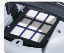
High filtration level with HEPA exhaust filter