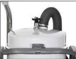
Manual filter shaker