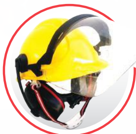
Safety Helmet with Ear Muff and Face Shield