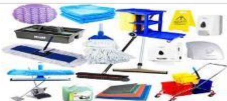
Floor Cleaning Items