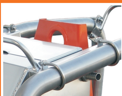
One centralized and balanced lifting eye.