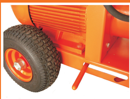
Galvanized frame with built in brake and pneumatic wheels.