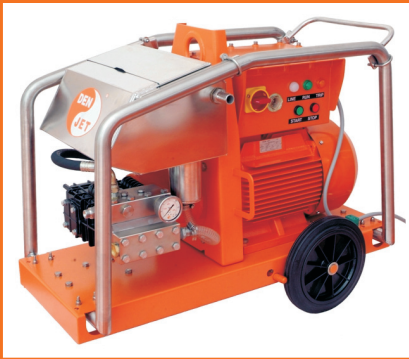
CE20-500 Super Slim