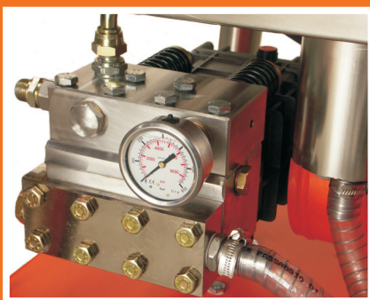
Stainless steel pump-head. Integrated unloader valve.