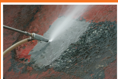
Surface- Sand blasting