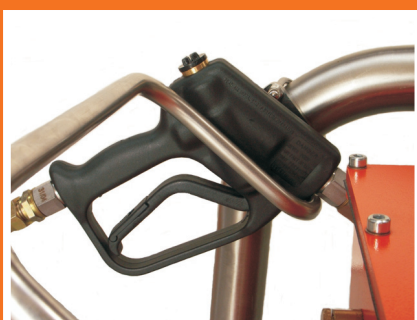
Stainless steel top-frame with gun rest / lance holder.