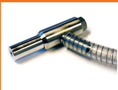
Sand Blasting Equipment