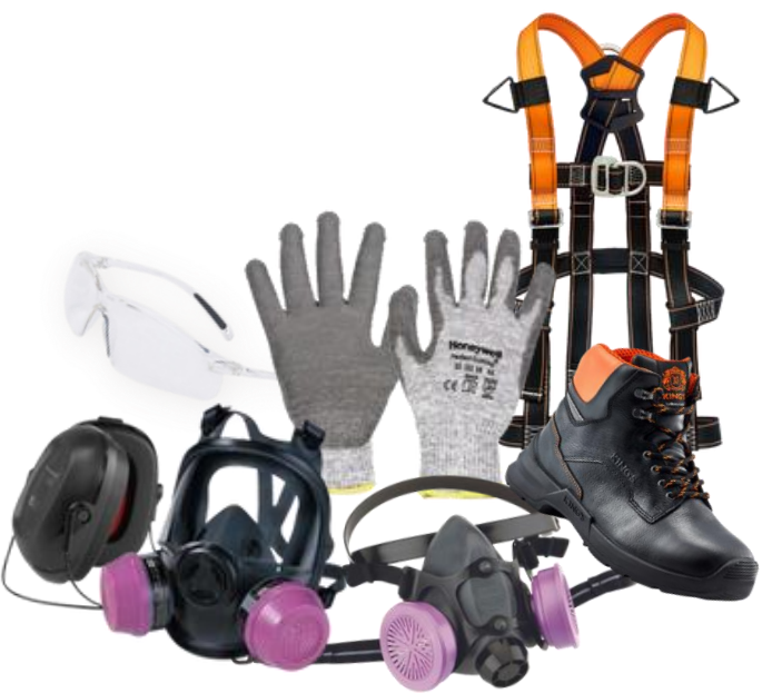
Personal Protective Equipment (PPE)