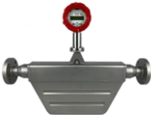
Coriolis Flow Meter