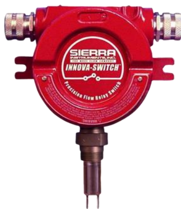
Gas Flow Meter