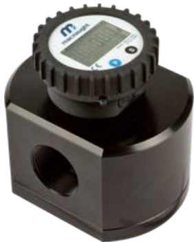
Oval Gear Flow Meter