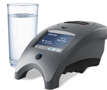
Water Test Kits and Portable