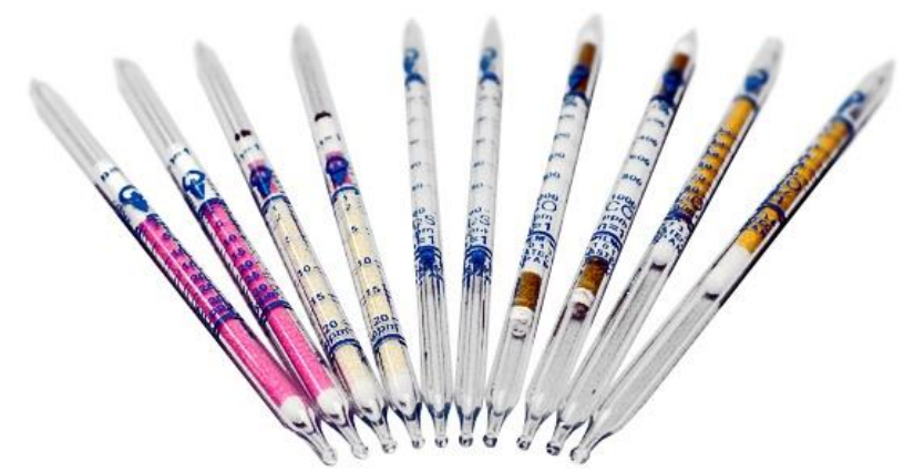
Gas Detection Tubes