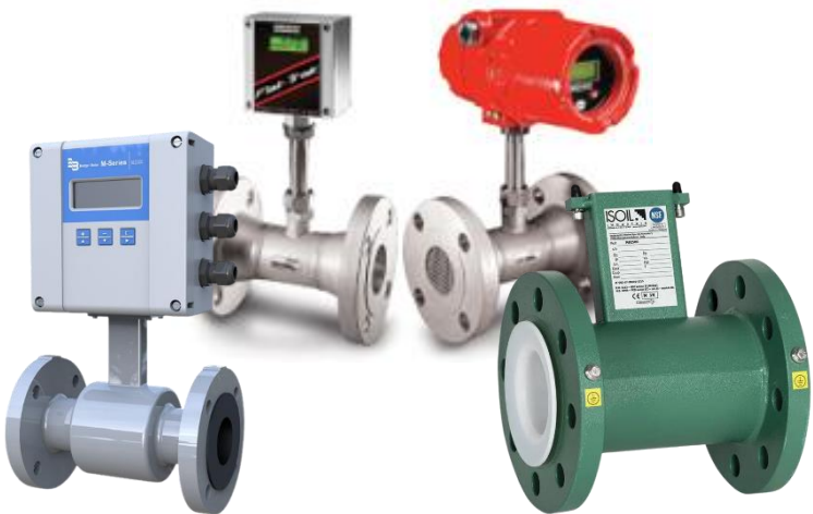
Electromagnetic Flow Meter