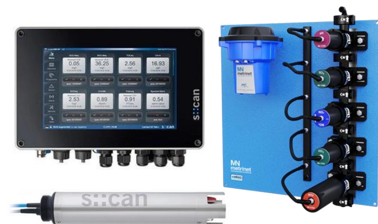
Online Water Quality Analyzer