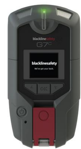
Lone Worker Connected Safety