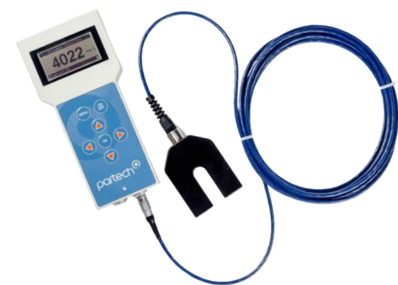
Portable Water Quality Analyzer