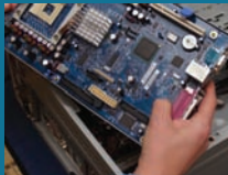
ON THE BOARD