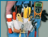
ON THE BELT