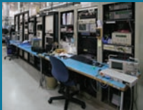
ON THE BENCH