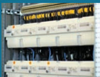
IN THE BOX